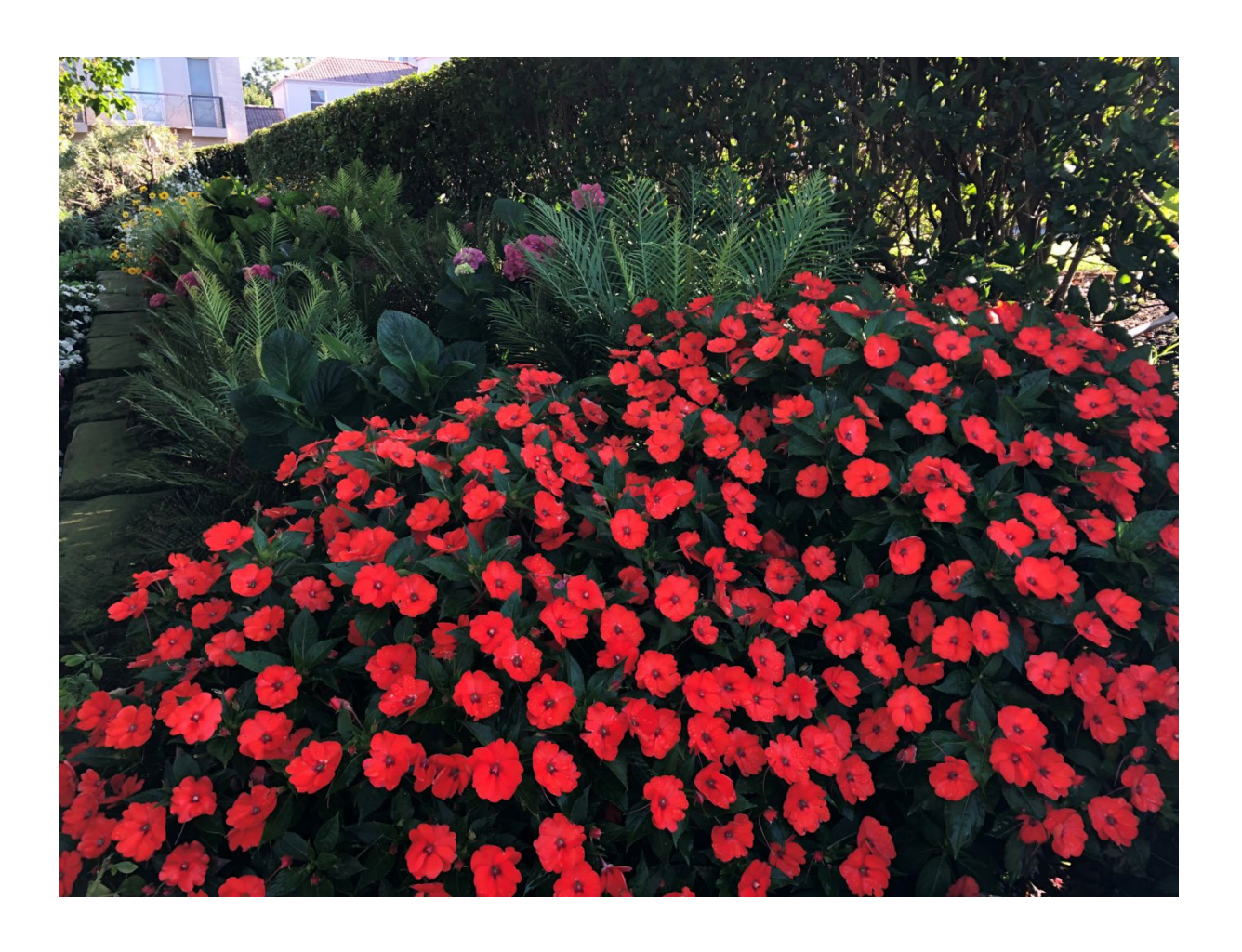
Impairents in flower with Silver Lady fern in the background.