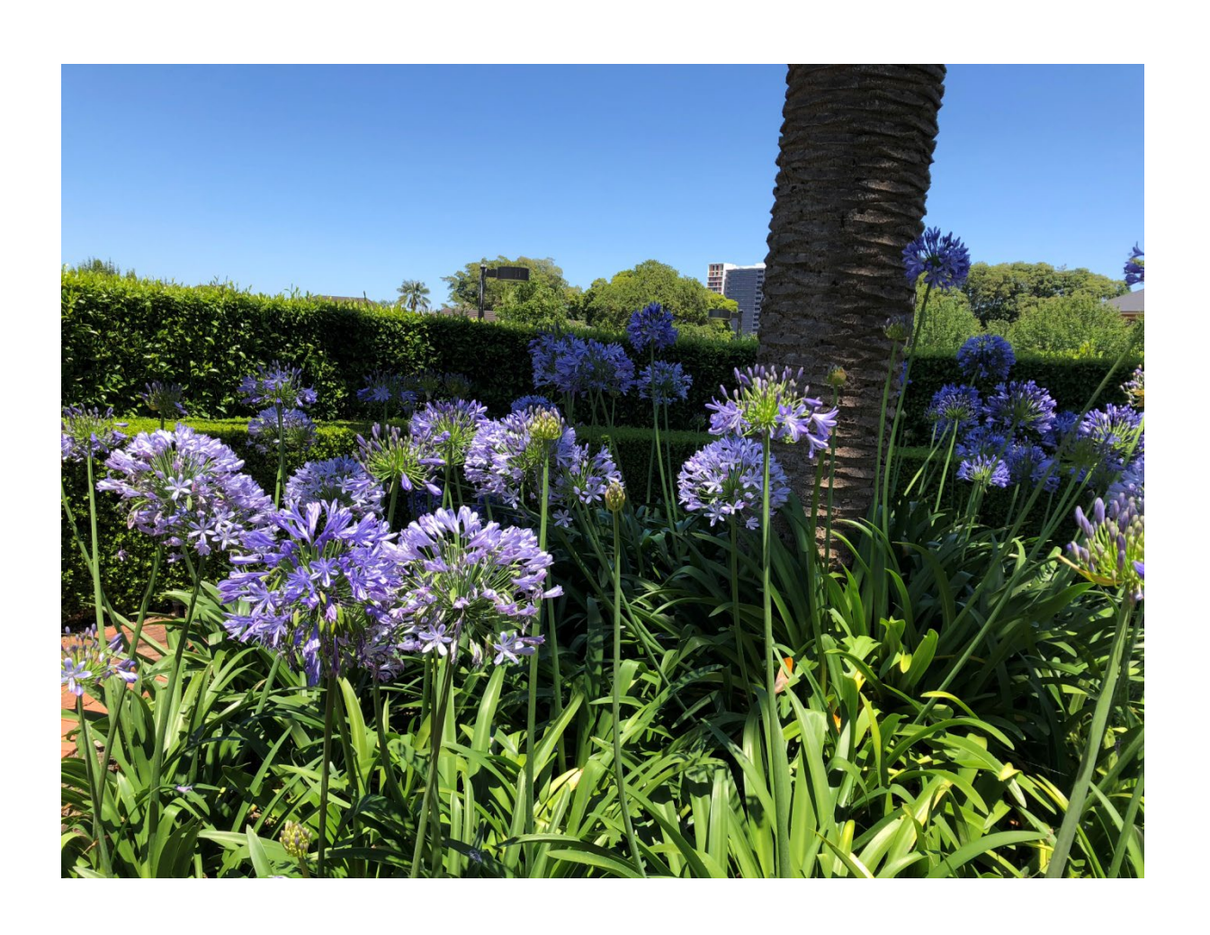
Agapanthus underneath the palm in Basin.