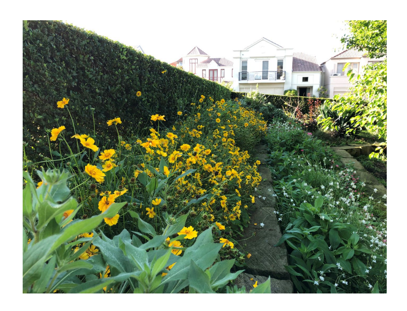
Carriopsis in flower at Link Gardens