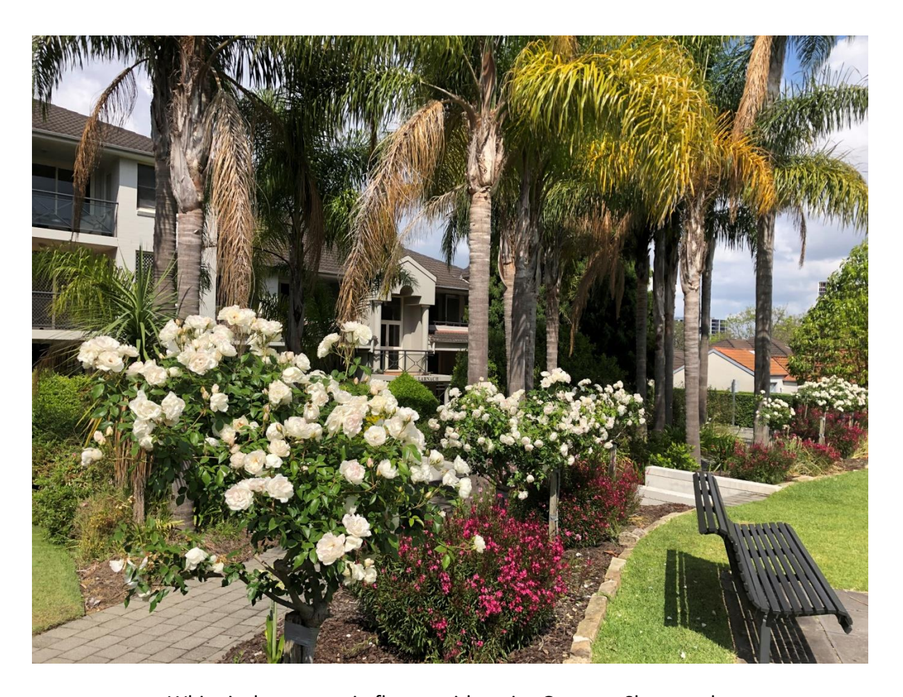
White iceberg roses in flower with cerise Guara at Sherwood.