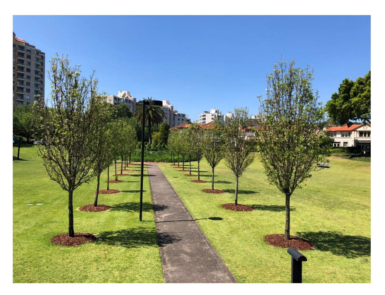
The first new foliage on the Ornamental Pear trees in the Basin.