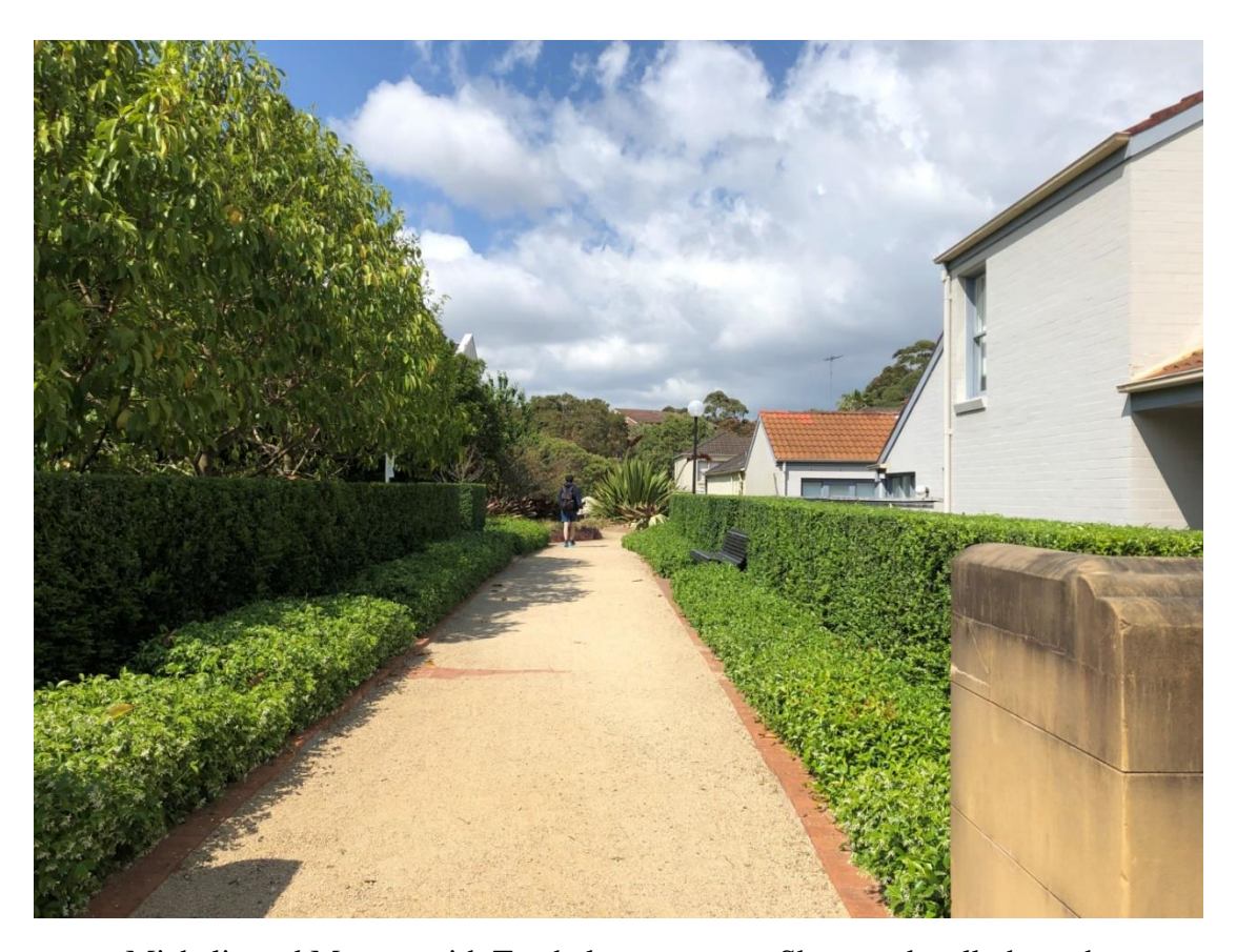
Michelia and Muraya with Trachelospermum at Sherwood walk through.