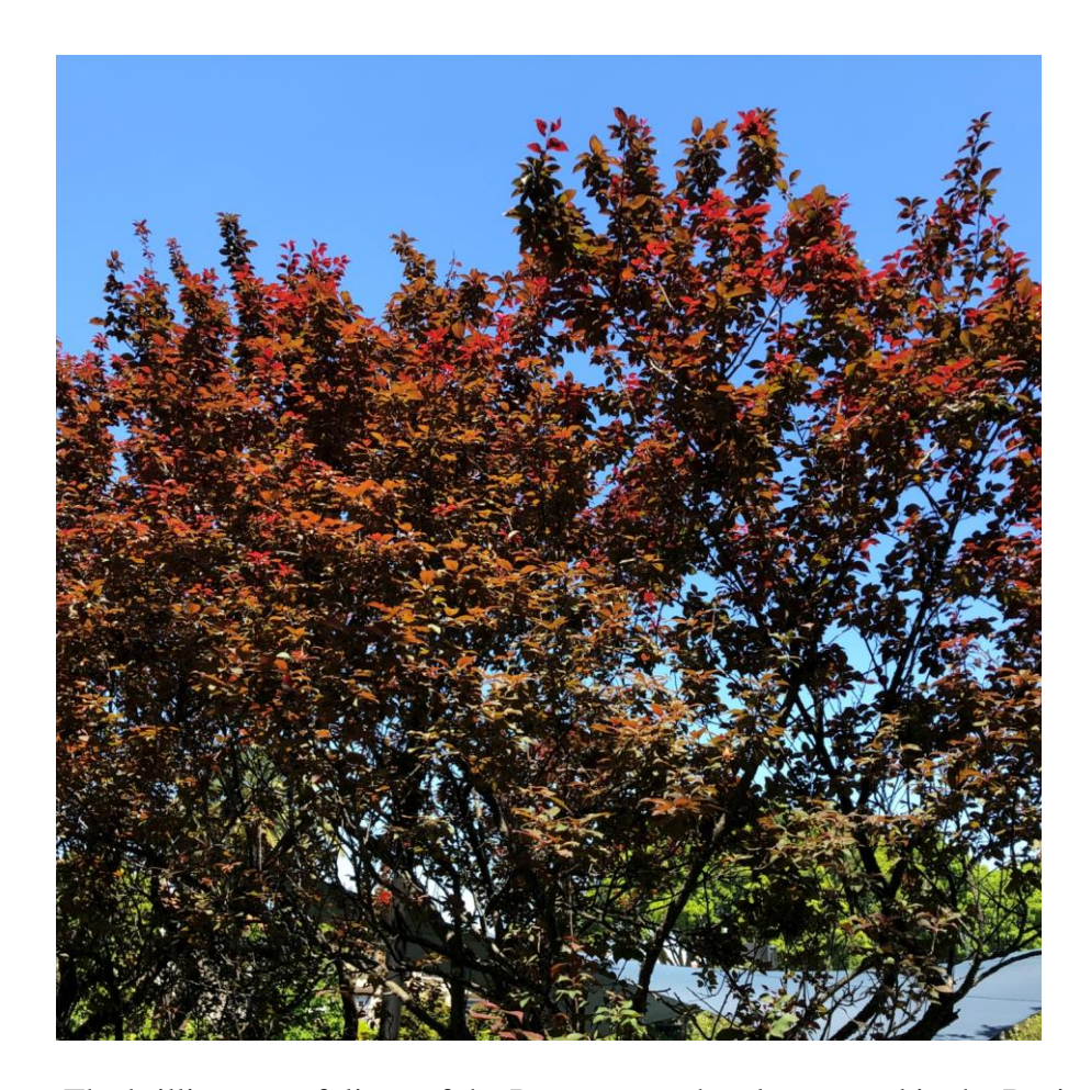
The brilliant new foliage of the Prunus near the play ground in the Basin.