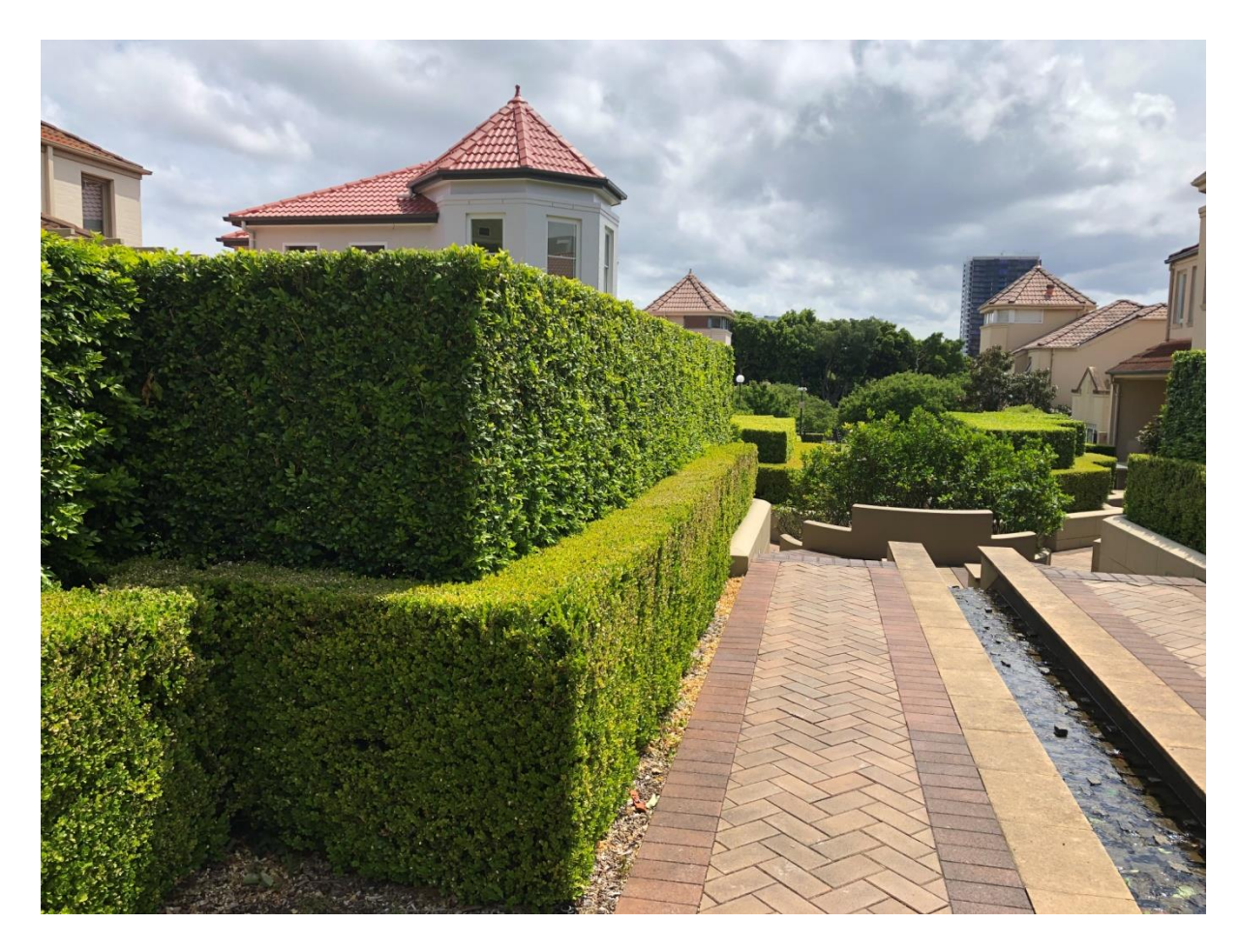
Murraya and Buxus hedges at the Water Race

ABN: 59 002 456 797 30 Cranbrook Street Botany NSW 2019 PO BOX 719 BOTANY NSW 2019 P: 1300 647 367 F: 02 9695 7452 E: info@greenoptions.com.au www.greenoptions.com.au