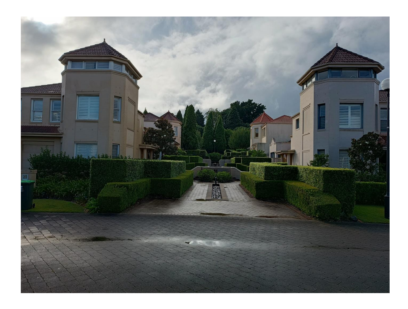
The hedges at the water race, taken in the early morning.