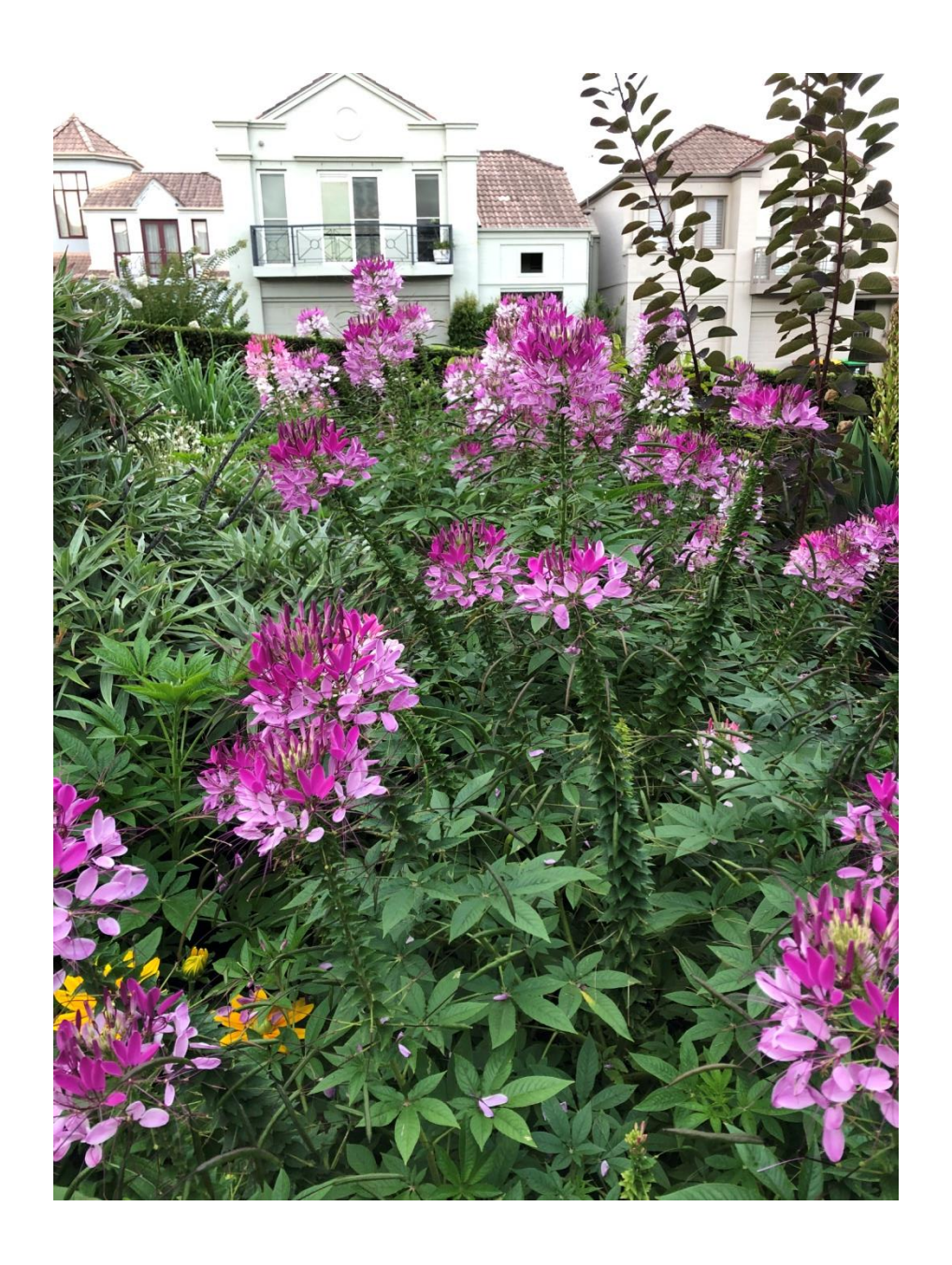
Spider flower at Link terrace garden.