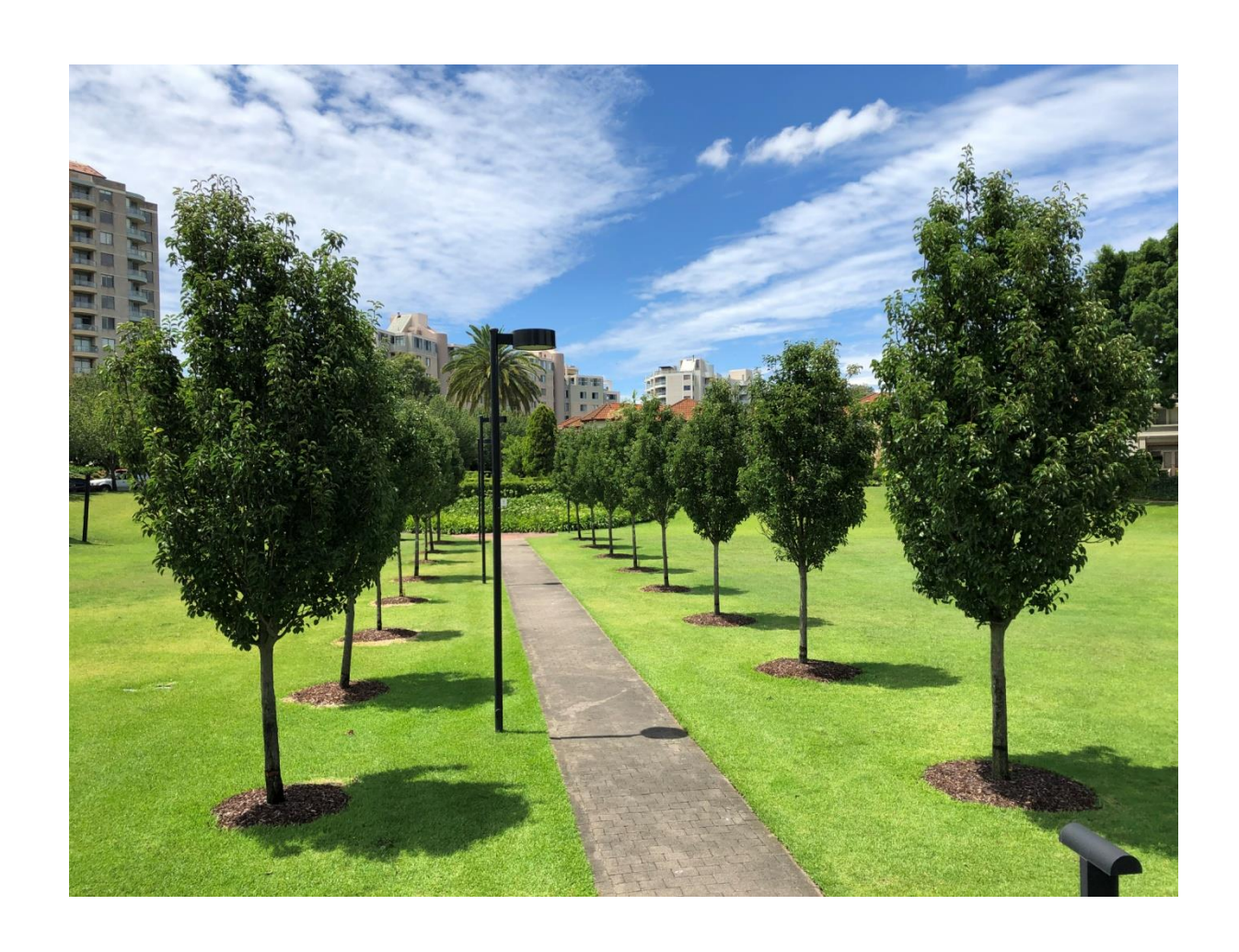
The Basin showing the avenue of ornamenta Pear trees.