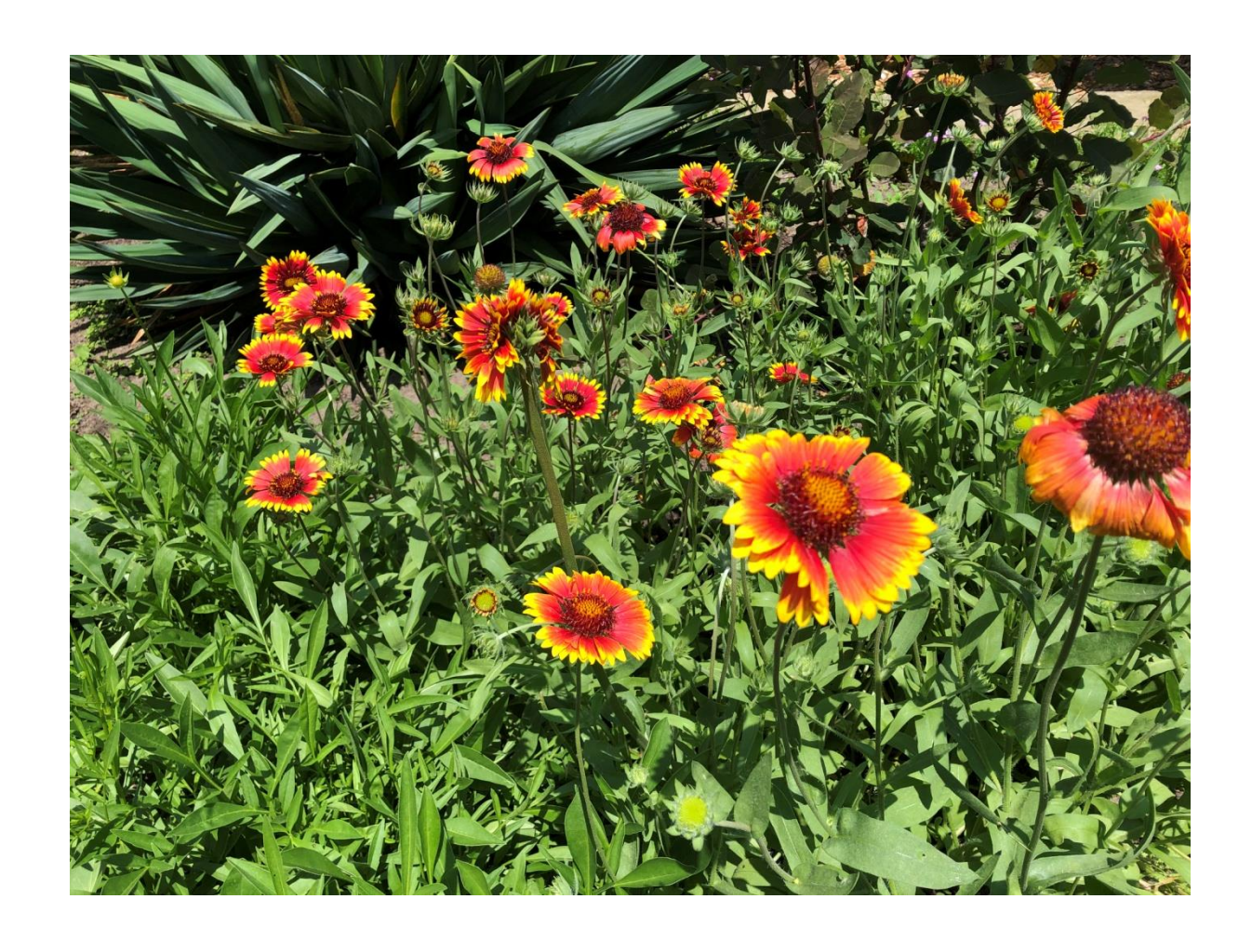
Gaillardia in flower at Link.