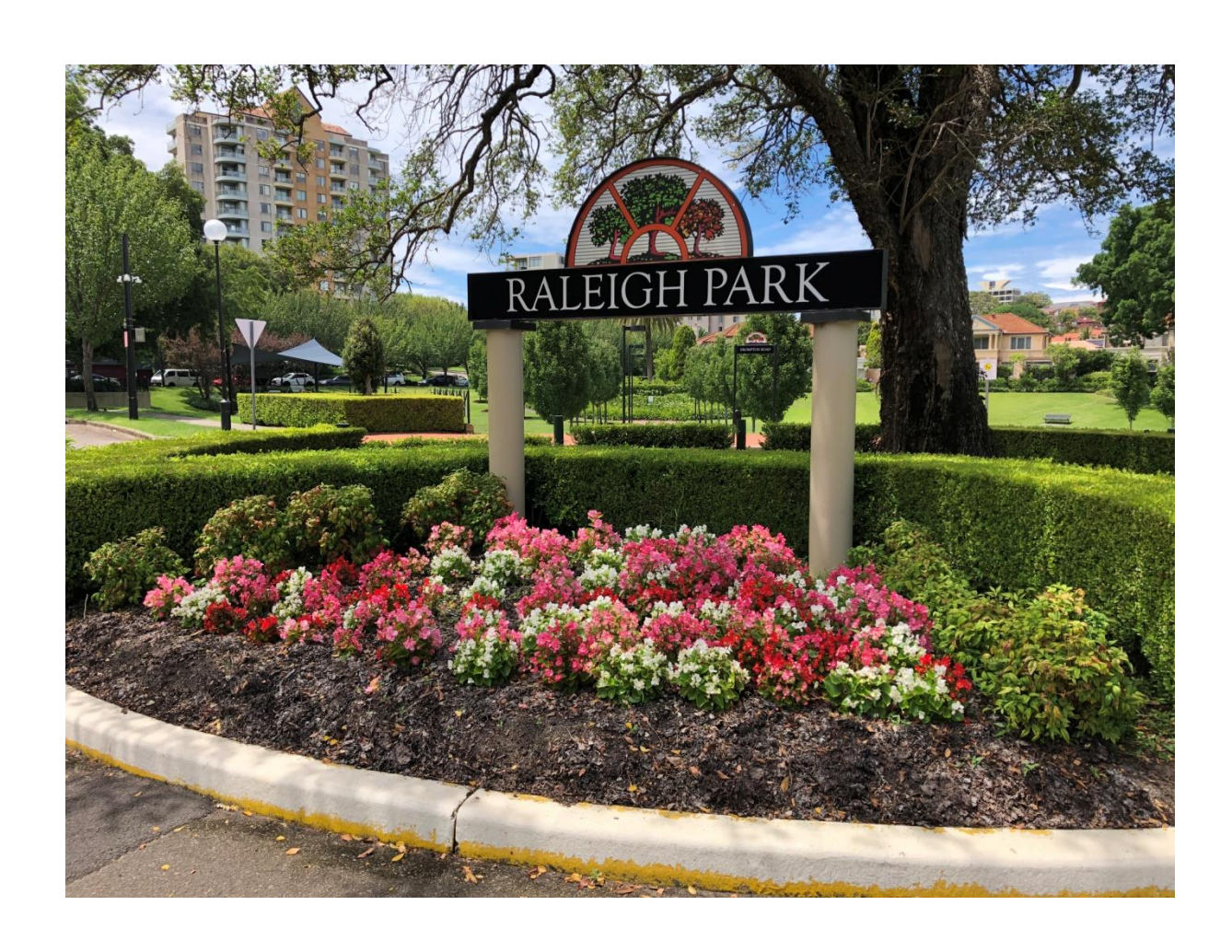
The Begonias at the round about.