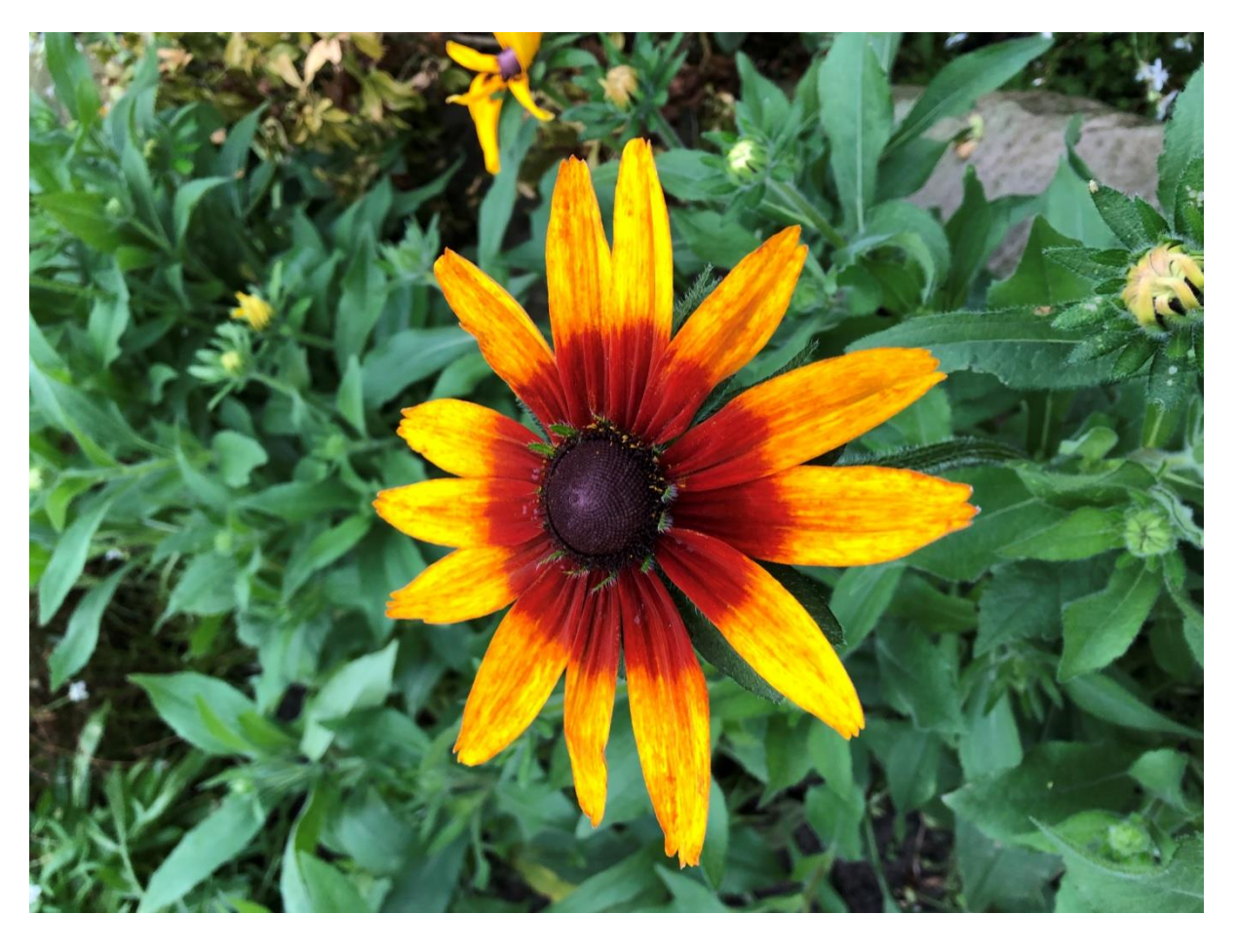
Rudbeckia in flower at Link terrace.

ABN: 59 002 456 797 30 Cranbrook Street Botany NSW 2019 PO BOX 719 BOTANY NSW 2019 P: 1300 647 367 F: 02 9695 7452 E: info@greenoptions.com.au www.greenoptions.com.au